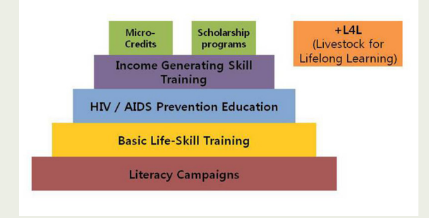
Figure 1: The Integrated Model of GAPA

EWB and its global partners believe that both the capacity-building of female education in Burkina Faso and empowering women generally will help them to achieve a more active role in the family and society. We see this as a fundamental means of combating the epidemic of female disen-franchisement in Burkina Faso. Providing women with learning opportunities, basic life skills, job and training are essential steps towards the development of self-reliance. EWB will play a key role in this process by applying an integrated approach to various educational programs, each of which has separately proven its effectiveness in Africa. These consist of our Literacy, HIV/AIDS and Malaria prevention education, income-generating skill training and micro-credit and scholarship programs. The integrated model of GAPA(Figure 1) is shown below and the livestock local bank have been added for job skill training in local communities.